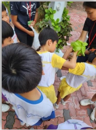
Our P4 Lasallians in action!

The Primary 4 Lasallians have been taught to take care of the plants and how to harvest them. After a harvest, the food produce will be handed to the school canteen stall vendors for their use.